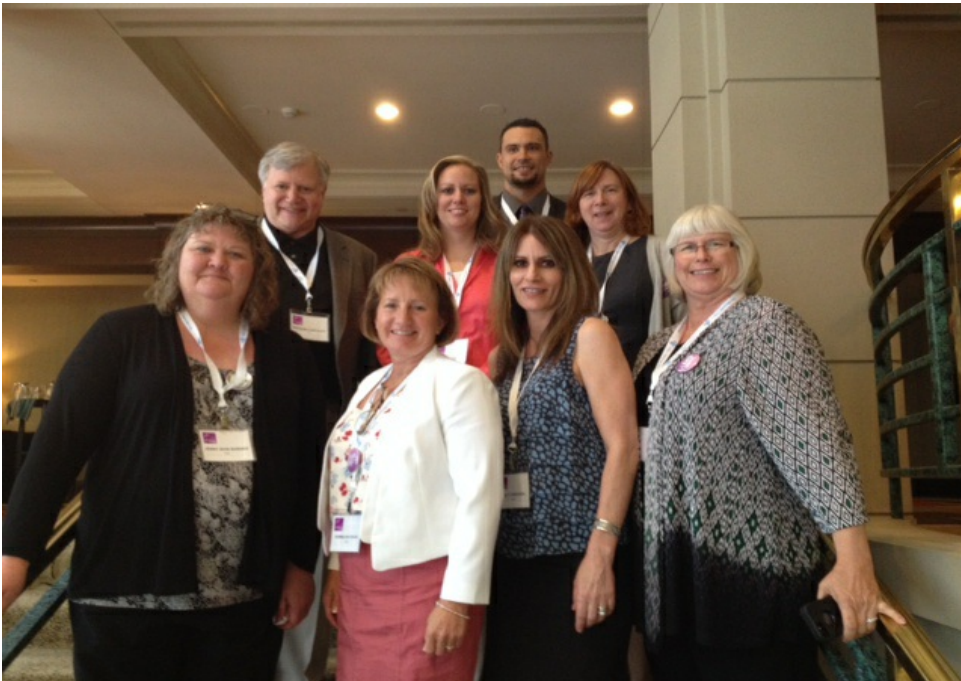
HAEA staff attending the 2014 HAEi Global HAE Conference

We will look forward to hearing where the 2016 HAEi Global Conference will be held!